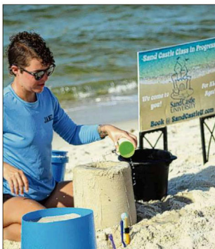
When you're at the beach, learn the techniques for building the best sand castle around with Sand Castle University.