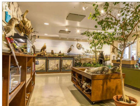
While you're at Gulf State Park, take time to explore the natural side of the Alabama Gulf Coast. A great starting point is the nature center, which showcases the plants and animals that call this region home.

For a look at some of Alabama's last remaining undisturbed coastal barrier habitat, hike the trails of Bon Secour National Wildlife Refuge. With more than 4 miles of easy trails, you can walk through varying habitats including wetlands, maritime forests and scrub habitats, among others. There's also a shaded observation tower where you can take in expansive views of the refuge. Plus, this destination tends to be less crowded than some of Gulf Shores and