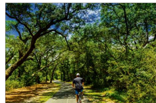
Comprised of more than 28 miles of trails that travel through nine distinct ecosystems, the Hugh S. Branyon Backcountry Trail in Gulf State Park is a must-see when visiting Alabama's coastal region.